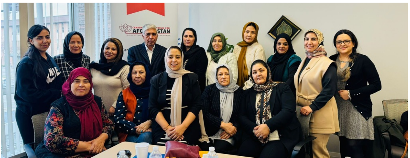
CFFA Meeting, Toronto, Canada