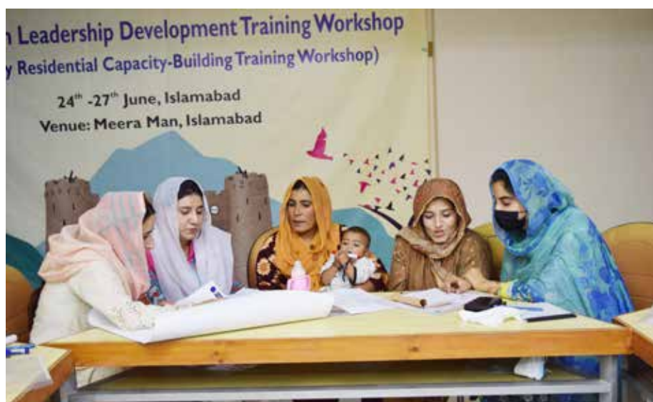
Participants of the Young Women Leadership Development Program (YWLDP), WRN Pakistan Seed Initiative

This training will help participants understand their rights, strengthen their agency, and form networks to influence their communities. We successfully selected 16 young emerging women leaders from 11 districts of Khyber Pakhtunkhwa , ensuring they represent diverse backgrounds and experience in working with local communities across various sectors such as health, education, skill training, agriculture, peacebuilding, and political empowerment. A comprehensive toolkit for Women Human Rights Defenders was developed by an expert scholar to further support these leaders.