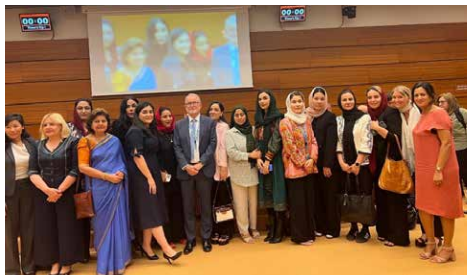
WRN Side Event at the 56 th Human Rights Council

Apartheid on the basis of race is a violation of the UN Charter, and a convention exists that criminalizes it. As such, perpetrators of apartheid bear criminal responsibility and are subject to prosecution, UN member states have obligations to respond when other states practice apartheid and can call upon the UN to suppress and prevent this crime. The international legal definition of apartheid however does not extend to systemic violations on the basis of gender. Sex and gender-based discrimination and persecution are also violations of international law as stated under the Universal Declaration of Human Rights (UDHR) and in the Convention on the Elimination of Discrimination Against Women (CEDAW), to both of which Afghanistan is a signatory, and to the Rome Statute of the International Criminal Court, which considers persecution on the grounds of gender as a crime against humanity. There are thus a limited range of measures that corresponds to the gravity of the violations and can be taken to hold perpetrators responsible, as well as measures to compel other states to respond more effectively to women’s human rights crises such as that occurring in Afghanistan. Although international action should not be dependent on the official recognition of gender apartheid, recognition from UN member states and within the UN system could be a crucial step towards codification and accountability to counter the systemic oppression that women in Afghanistan continue to face.