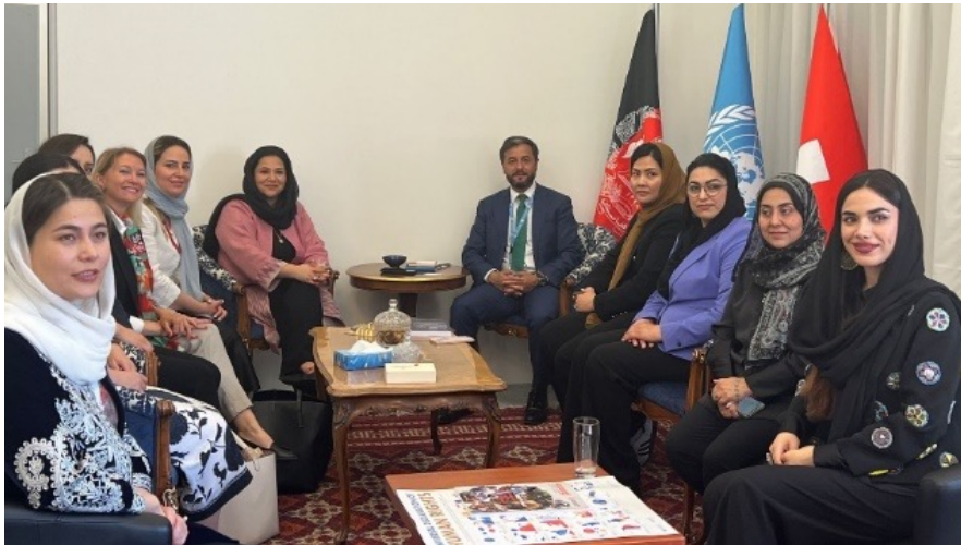
Delegation of WRN and Afghan women activists meeting with the Afghan Ambassador at the Embassy in Geneva, Switzerland

Geneva, Switzerland. The event was hosted by Afghanistan’s Permanent Mission to the UN in Geneva, Albania’s Permanent Mission to the UN in Geneva, Center for Dialogue and Progress – Geneva, Women’s Regional Network, Canada’s Feminist Forum for Afghanistan, Womankind Worldwide, Atlantic Council Strategic Litigation Project, and the Georgetown Institute for Women, Peace and Security.