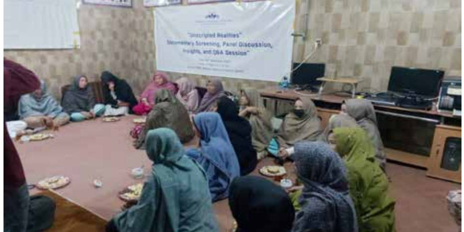
WRN Film Festival and discussion, Quetta

After the influx of Afghan refugees in recent years in different cities of Pakistan, particularly Balochistan Province and KP, many social issues emerged. Many individuals, organizations, groups, networks, and