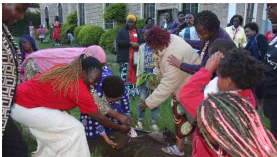
Tree planting ceremony as part of the education on greening practices.