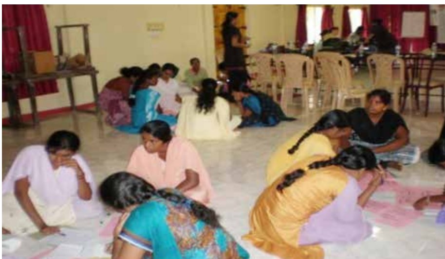
Sri Lankan seed initiative stakeholder consultations