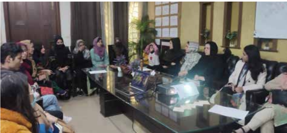
WRN Film Festival Event, Peshawar. The UNHCR representatives highly appreciated organizing these events as this helped them listen to the Afghan women and their challenges, concerns and solutions.

WRN was a vetted partner of Vital Voices which supports Afghan WHRDs at risk. WRN referred cases from our larger network of Afghan Members. WRN selected the most dire cases, working with a small WRN Committee for verification, budget review, translations, application support and secure transmission as well as follow-up. WRN also supported application writing for other funds as required and applicable. WRN has closed this mechanism, handing it over to Canada's Feminist Forum for Afghanistan, the WRN Afghanistan seed initiative, having supported over 25 cases of women under threat due to their activism.